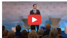
NATO StratCom: The Influence Principle of Authority