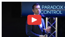
Breakthrough Summit: Rewire your Mind