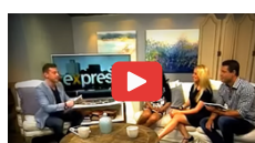
Expresso Show: Thought-Decoding (Filmed 2015)