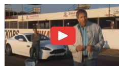
Carte Blanche: Putting the Mentalist to the Test (Filmed 2012)