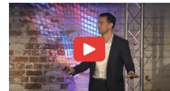
Client Event: Formula for Self-Influence